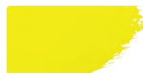
912 Lemon yellow