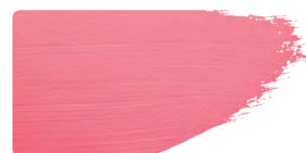
982+923 / 10:1