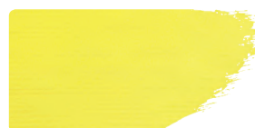
983+912 / 1:1