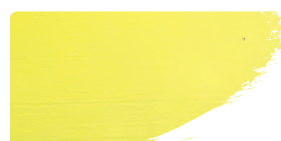
982+912 / 1:1