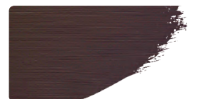
973+923 / 1:1