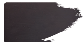
973+923 / 10:1