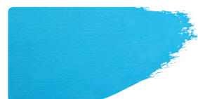
983+949 / 10:1