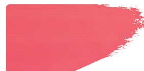
983+923 / 10:1