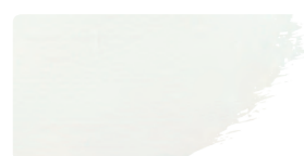
988 Crystal white