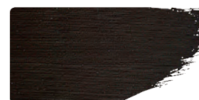
973+912 / 10:1

The adding of white to a colour is a good test of the latter's quality. High-quality colours will continue to offer a pure and vibrant effect even after white has been added. Our Studio Original Transparent White produces particularly bright, vibrant results. For more muted pastel hues, we suggest the adding of Titanium White.