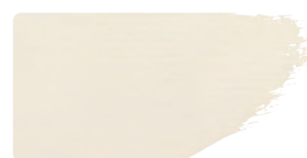
987 Shell white