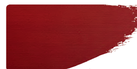
975+923 / 1:1