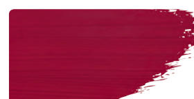
925 Carmine red