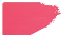
982+923 / 1:1