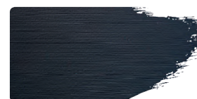
973+949 / 10:1