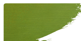
975+912 / 1:1