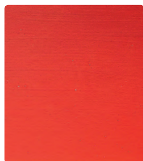
923 Bright red