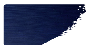
949 Prussian blue