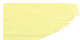
982+912 / 10:1