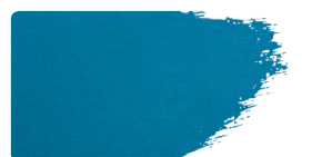
983+945 / 1:1