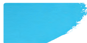
982+949 / 10:1