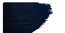
973+949 / 1:1