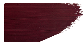
975+923 / 10:1