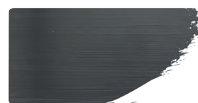
975 Transparent black