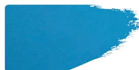
982+949 / 1:1