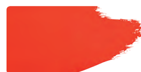
923 Bright red