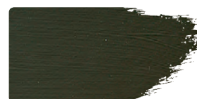
973+912 / 1:1