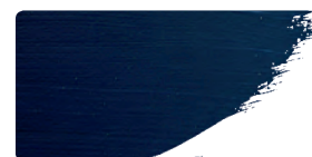
975+949 / 10:1