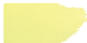
983+912 / 10:1