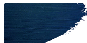
975+949 / 1:1