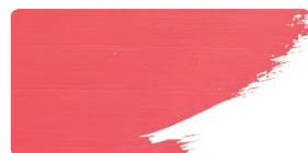
983+923 / 1:1