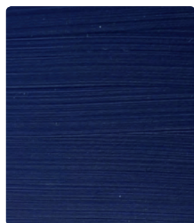
949 Prussian blue