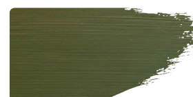
975+912 / 10:1